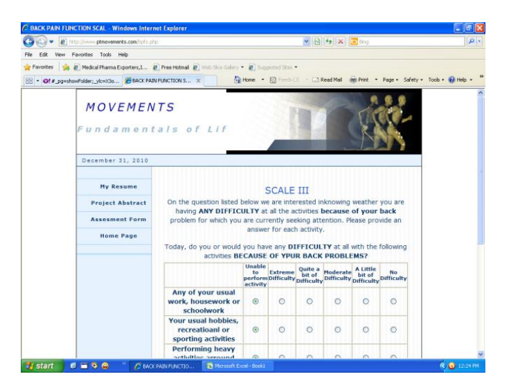
Fig: 2 suggesting a webpage of BPFS

The website access was constructed with guidelines for voluntary participation for the study includes basic health assessment form, self reported health questioners, feedback forms and treatment procedures etc... 18,30 subjects were selected at two stages at (1) The Internet Based Health Assessment Procedure and (2) The Internet Based Treatment Procedure. (Flow chart 1)